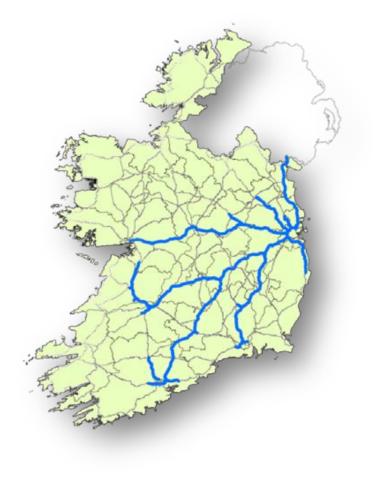
Figure 2 : LRI/LRM location

LRI signs and LRM markings will typically appear on motorway/dual carriageway sections of the national road network, as outlined in Figure 2.