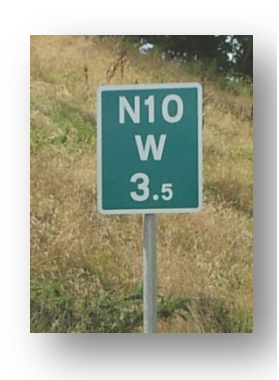
Figure 1 : LRI Signs