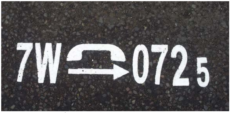
Figure 2 : Location Reference Marking

Location Reference Markers (LRMs) supplement the LRI signs. Location reference Markers are painted in the hard shoulder parallel to the road. The LRM indicates the route and the direction of travel along with distance from the start of the route. In addition the LRMs indicate the direction to the nearest emergency telephone. An example LRM is indicated in Figure 2 below. LRMs are painted in the hard shoulder every 100 metres.